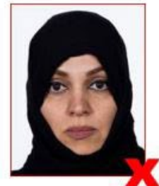
Eyes/edges of face obscured