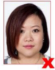
Hair obscuring face