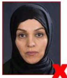
Background too dark