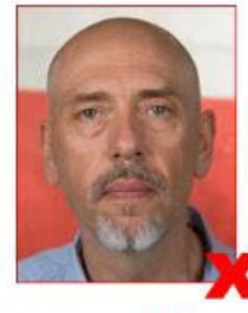
Background not plain