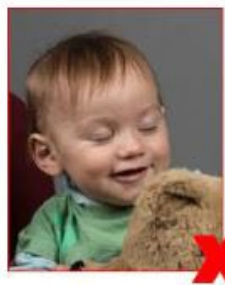
Eyes not open/toy visible