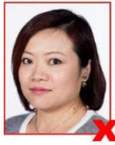
Side on to camera