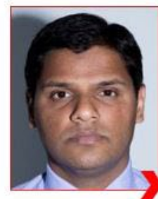
Shadows on image and background